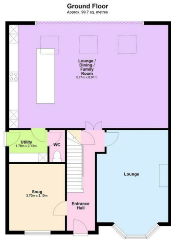
Total area: approx. 147.9 sq. metres